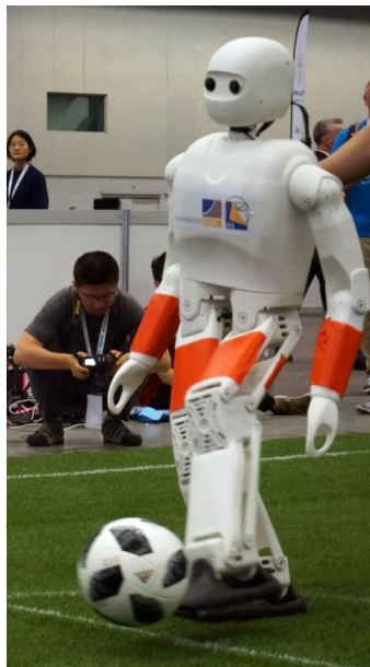
Fig. 1. The NimbRo-OP2X robot.

{ pavlichenko | ficht | schreiber | behnke } @ ais.uni-bonn.de http://www.nimb-ro.net