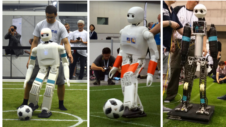
Fig. 2. NimbRo AdultSize team robots. Nimbro-OP2 (left), Nimbro-OP2X (center) and Copedo (right).

robot (including the design stage and software adaptation) was only three months. Apart from screws, nuts, bearings, actuators, and electronics, the entirety of the robot is 3D printed using SLS. To support the weight of the robot with inexpensive actuators, parallel kinematics (in the leg pitch joints) and gear transmissions (in the leg roll and yaw joints) have been used. In comparison with the Nimbro-OP2, the gears have been redesigned. The Nimbro-OP2X uses 3D printed gears as shown in Fig. 3. This platform has 18 DOF, 5 per leg, 3 per arm and 2 in the neck [9].