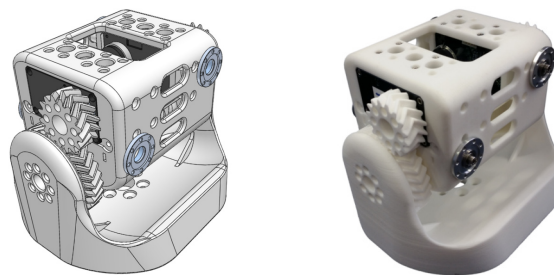
Fig. 3. Hip joint utilising 3D printed double helical gears. CAD model (left) in comparison to the real joint (right).

Copedo is 131 cm tall and 10.1 kg in weight. This platform is constructed from milled carbon fiber parts that are assembled to rectangular shaped legs and flat arms. The torso is constructed entirely from aluminum and consists of a cylindrical tube and a rectangular cage that holds the main electronic components.