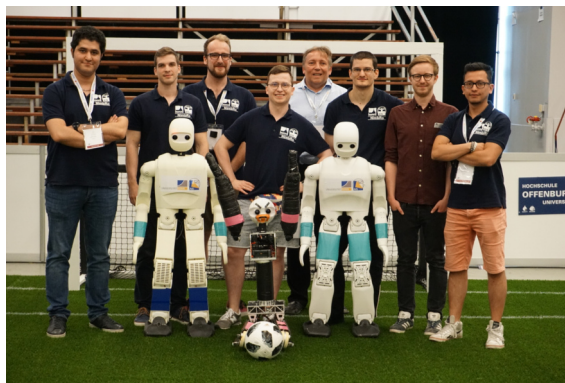
Fig. 1. The NimbRo team at RoboCup 2018 in Montreal, Canada.

Each year, the competition rules are adapted to resemble more real soccer scenarios and to be more compliant with FIFA rules. This enforces the teams participating in the Humanoid League to improve drastically both the hardware and software capabilities of their platforms. In 2019, for example, the number of