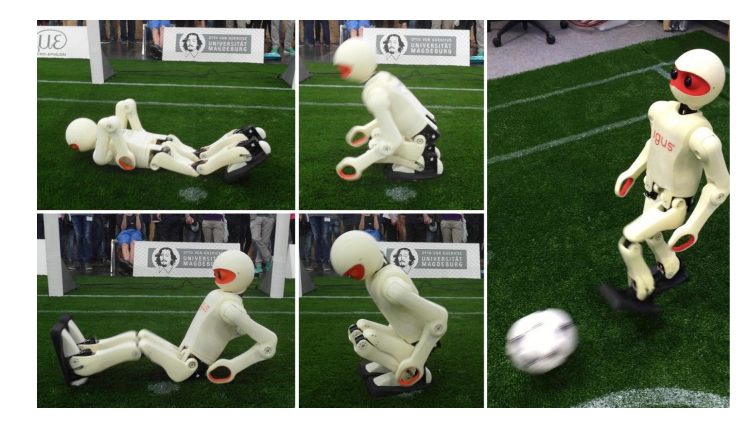
Fig. 3. Dynamic get-up motions, from the prone (top row) and supine (bottom row) lying positions, and a still image of the dynamic kick motion.

however, is a representation that was specifically developed for humanoid robots in the context of walking and balancing.